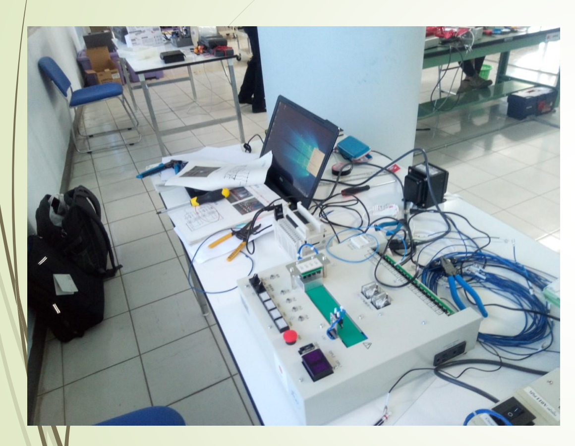
NSTC Level 2 Testing Machine Setting