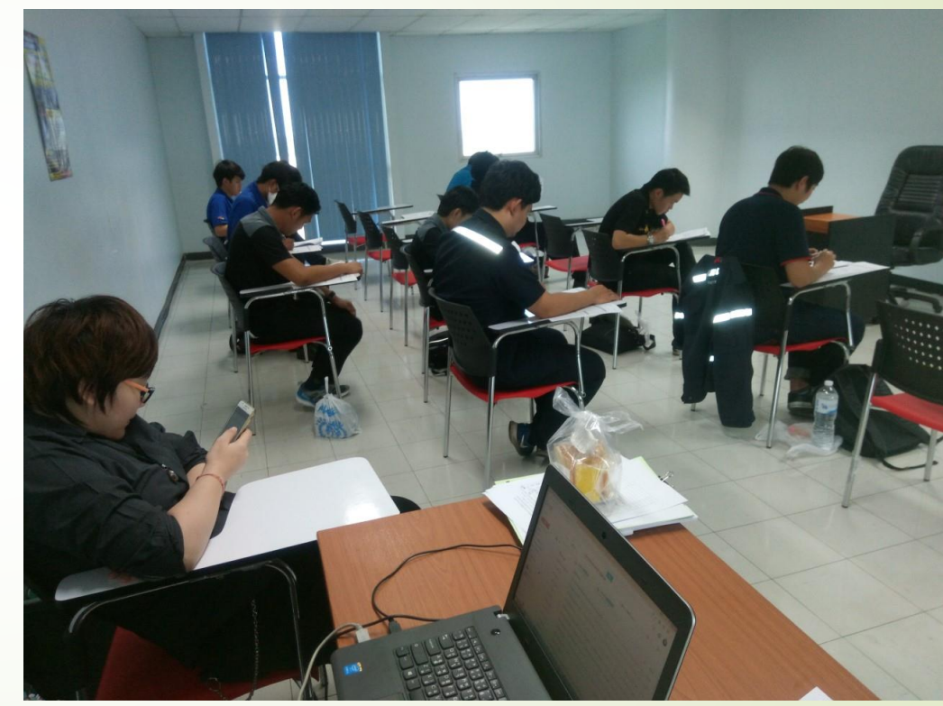
NSTC Testing Trial for Practical Exam