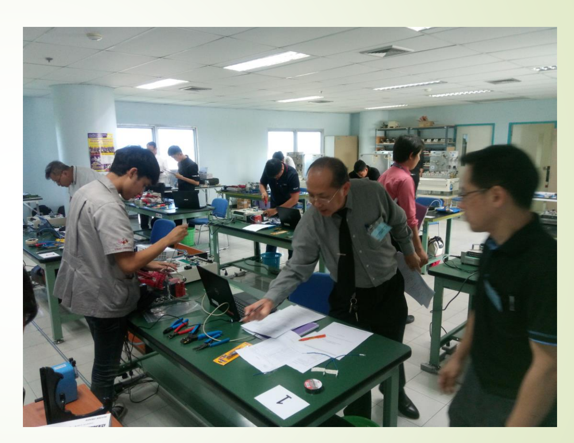
NSTC Level 1-2 Testing Trials Landscape